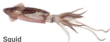
Squid Loligo vulgaris