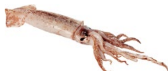
Squid Omastrephes bartramii