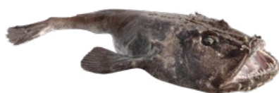
Monkfish tails Lophiomus spp