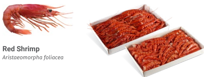
Red Shrimp Aristaeomorpha foliacea