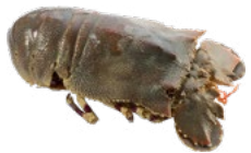
Slipper Lobster Scyllarides elisabethae