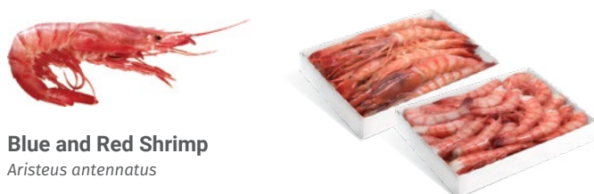
Blue and Red Shrimp Aristeus antennatus