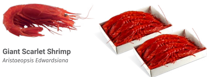
Giant Scarlet Shrimp Aristaeopsis Edwardsiana