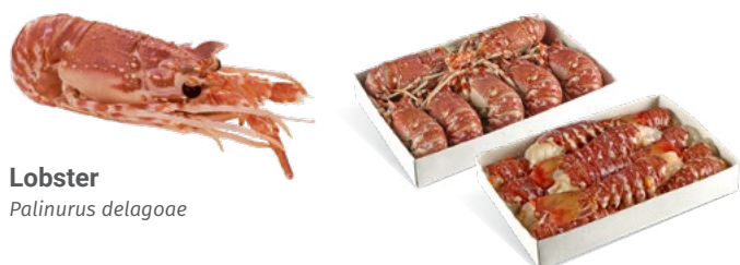
Lobster Palinurus delagoae